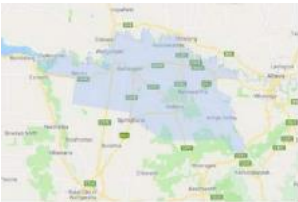
RUTHERGLEN GEOGRAPHICAL INDICATION - 1